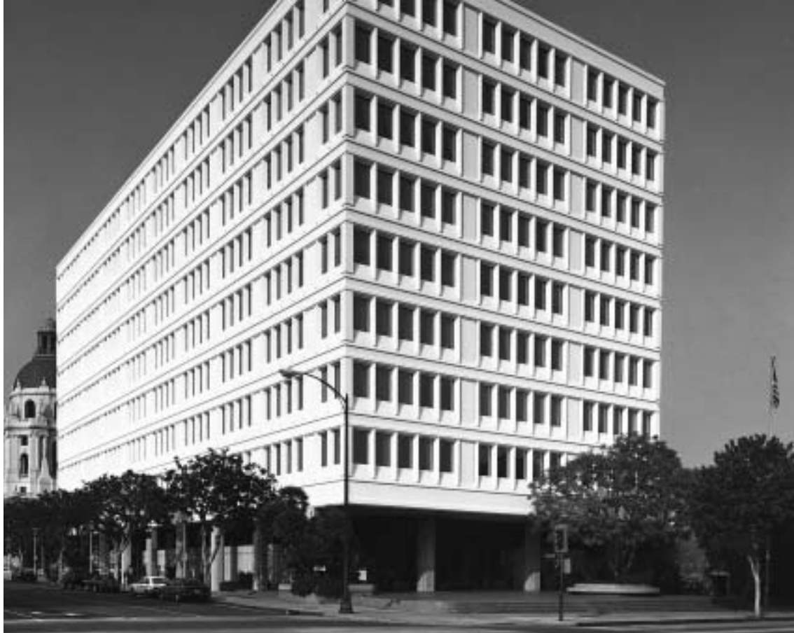
Office building owned by Wesco's property subsidiary, with Pasadena city hall in the background