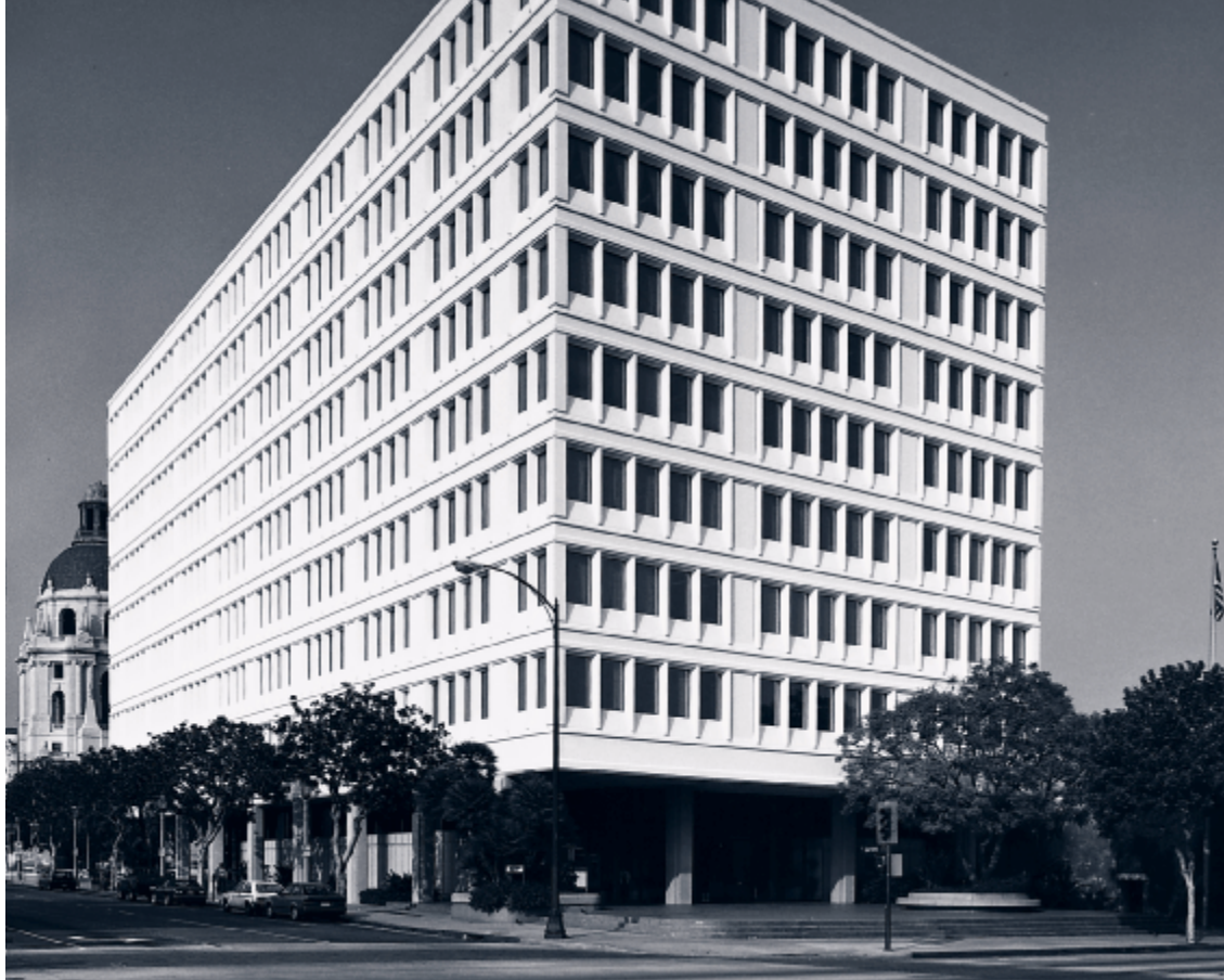
Office building owned by Wesco's property subsidiary, with Pasadena city hall in the background